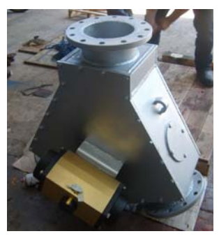
Silo Diverter Valve, For Pulp chip, Carbon steel, Size 200 mm