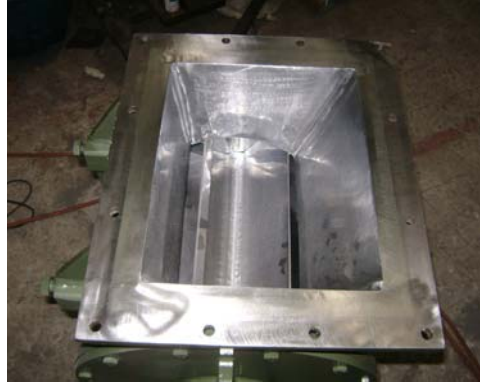
SIZE 14.0" ,carbon steel, for wood dust, pneumatic conveying system, plywood factory 100 % fit on the place of the existing unit from MOTAN