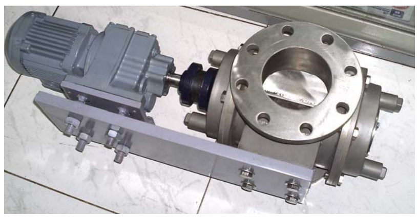
SIZE 6.0", SUS 304, with water cooling chamber ,for car coolant film scrap recycle, pneumatic conveying system