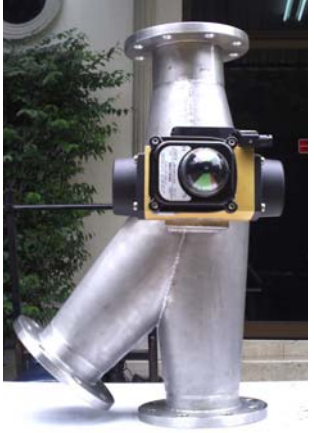
Low pressure , Corn flakes pneumatics conveying system, SUS 304, Size 100 mm