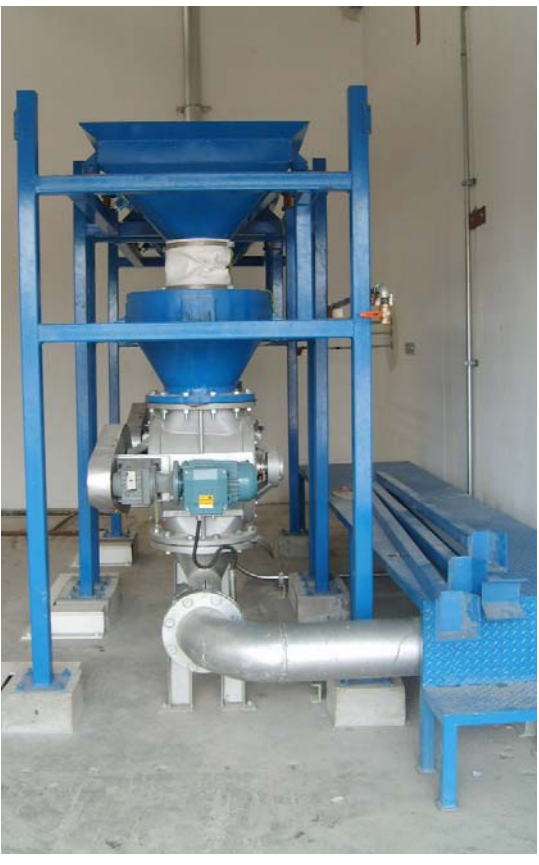
Bulk Bag Unloading Station for Bentonite clay powder