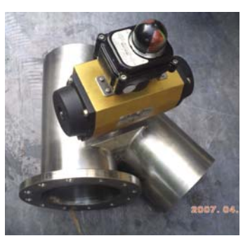
Material Feed Valve, for EVE, SUS 304, Size 100 to 80 mm , Special made shape