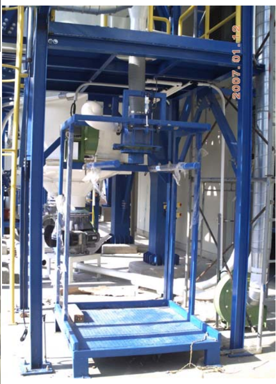
Bulk Bag Loading Station for paper pulp chip (raw material for dynamite bomb)