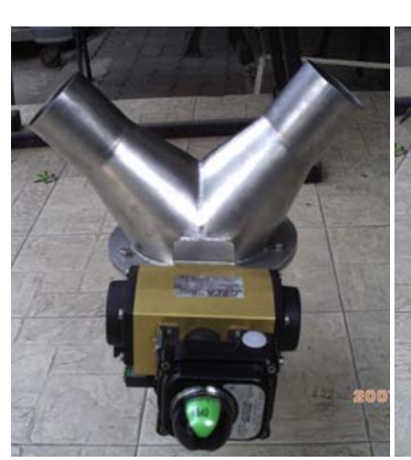
Silo Diverter Valve, For EVE, SUS 304, Size 100 mm