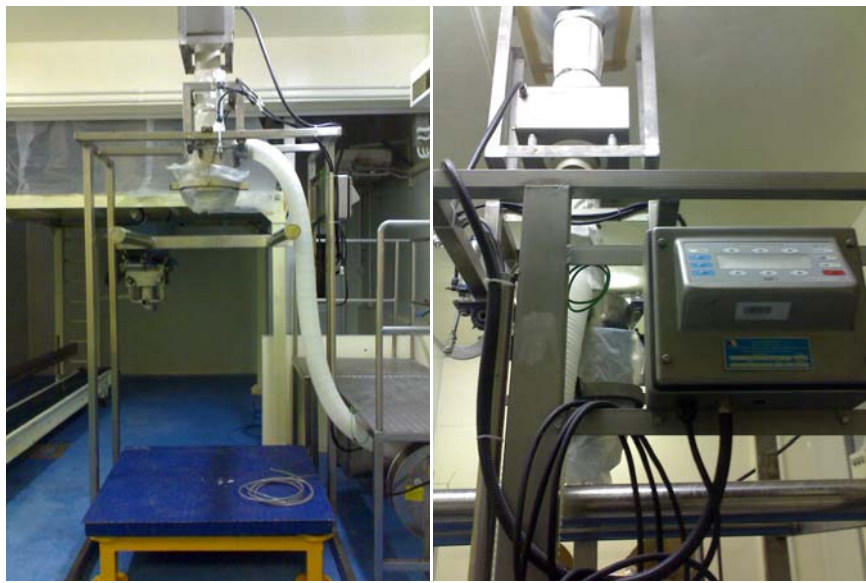
Bulk Bag Loading Station for Coffee-mate with metal detector