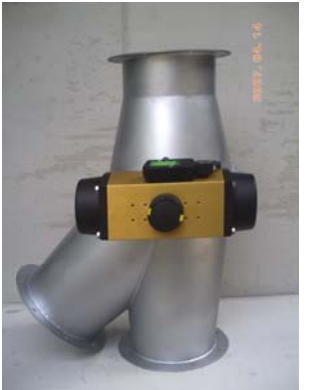
Paper Trim removal system, Carbon steel, Size 200 mm