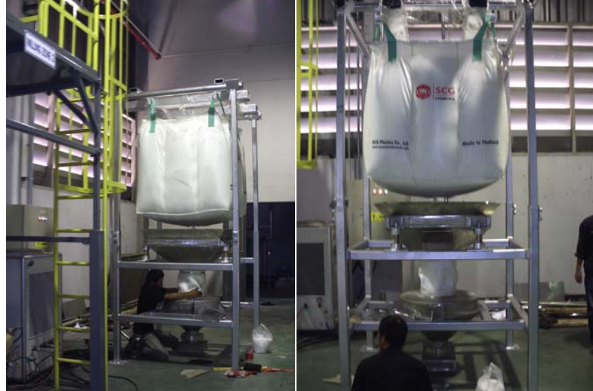
Bulk Bag Unloading Station for EVA powder