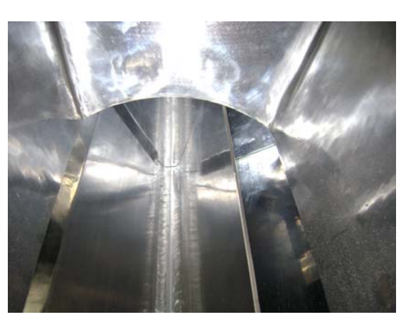
Inner part hard chromed coating to withstand the sand dust from sand paper