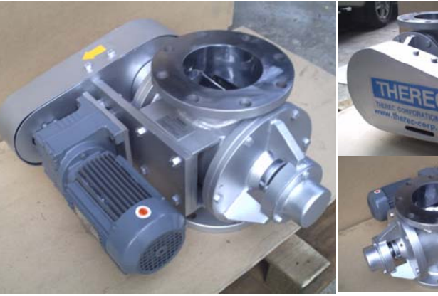
Standard TRC Rotary valve size 4.0" to 14.0", in SUS 304 and Carbon steel (hard chromed coating in option)